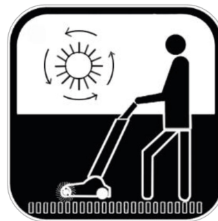
BRUSHING POWERED VACUUMING